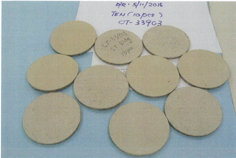
Photo 1: Ten (10) pieces of Kalsi® Fibre Cement board, Ø96mm x 5mm thick, were received on 5/11/2015.