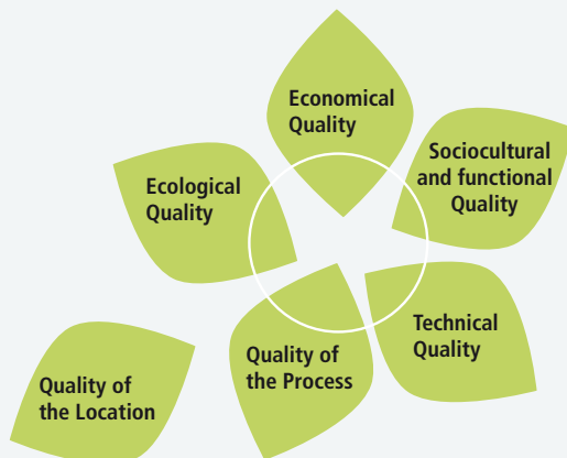
DGNB Certificate: the six areas of evaluation

As a clear and easily comprehensible rating system, the certificate covers all relevant fields of sustainable building and distinguishes outstanding buildings in gold, silver and bronze. Six areas of evaluation are singled out in the assessment: ecology, economy, socio-cultural and functional aspects, techniques, processes and location. The location is reported separately.